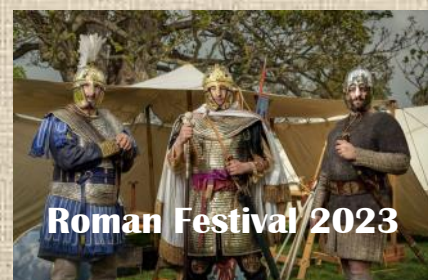
Roman Festival 2023

Details can be found here : Whilst this festival is not linked to our schools, we believe it would be enjoyed by the whole family. It will certainly help to reinforce and consolidate the work that KS2 children have been doing this term.