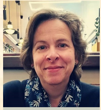
Message from the Governors

I attach a poster with further details. If you have any questions or concerns about Operation Encompass, please do not hesitate to contact us.